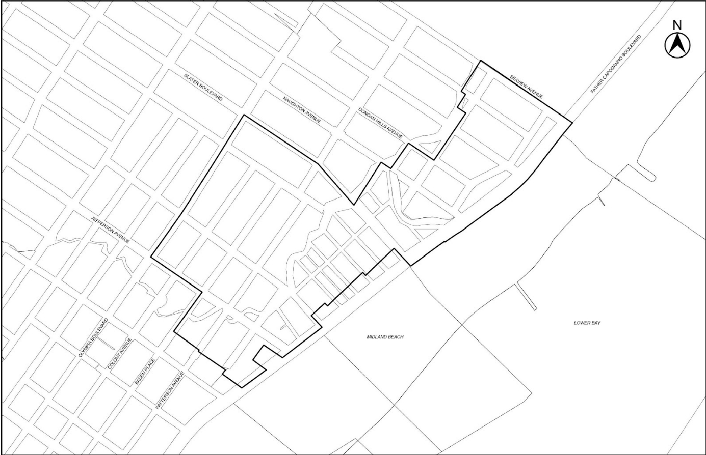
Map 3 - Special Coastal Risk District 3, encompassing New York State Enhanced Buyout Areas in Graham Beach and Ocean Breeze, Community District 2, Borough of Staten Island (9/7/17)