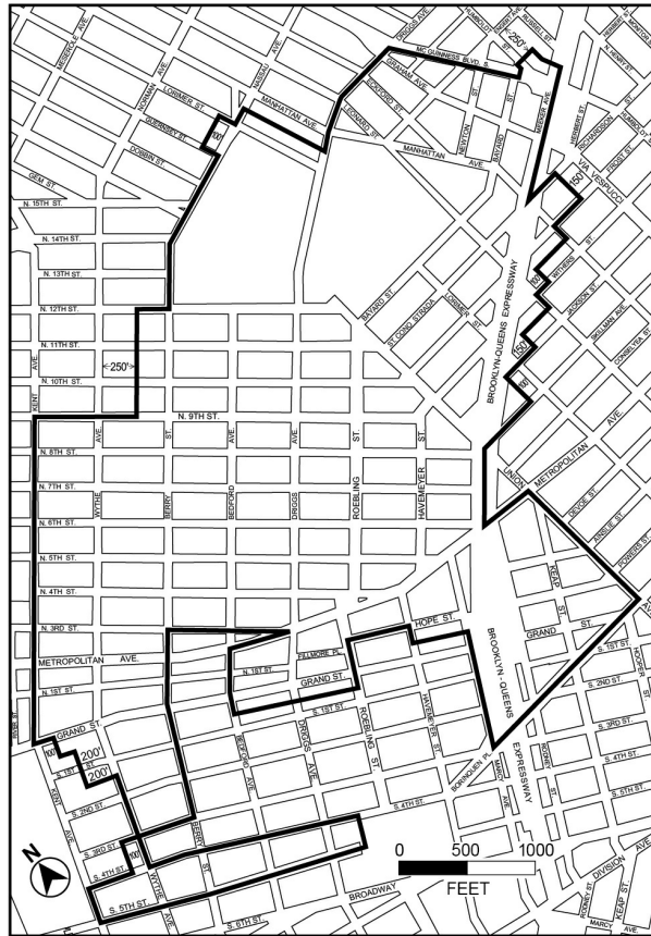
— Anti-harassment area