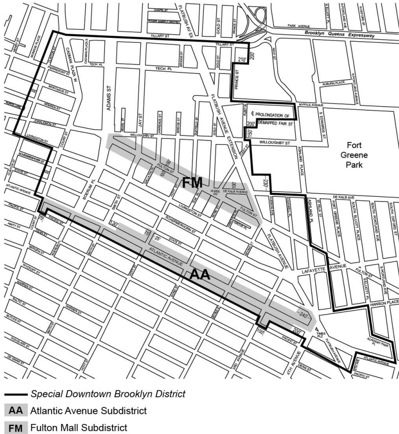
Map 1 — Special Downtown Brooklyn District and Subdistricts (12/10/19)