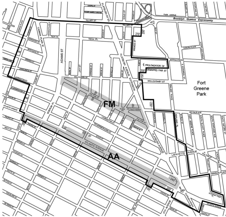
Map 1 — Special Downtown Brooklyn District and Subdistricts (12/10/19)