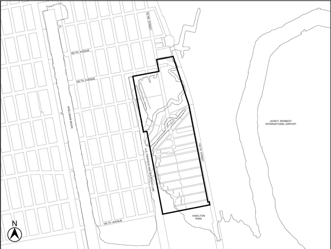
Map 2 - Special Coastal Risk District 2, in Hamilton Beach, Community District 10, Borough of Queens (6/21/17)