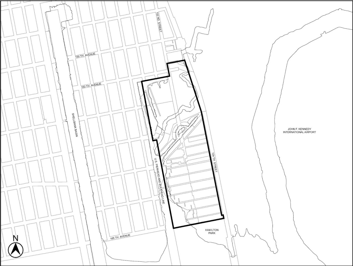
Map 2 - Special Coastal Risk District 2, in Hamilton Beach, Community District 10, Borough of Queens (6/21/17)