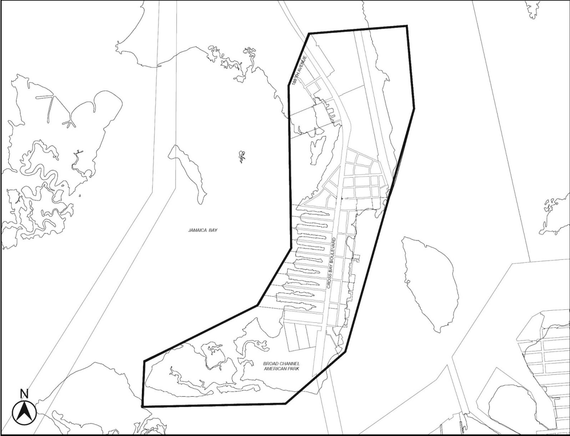
Map 1 - Special Coastal Risk District 1, in Broad Channel, Community District 14, Borough of Queens (6/21/17)