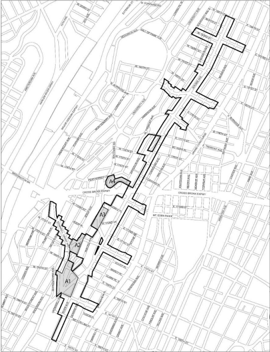
Map 1. Special Jerome Corridor District, Subdistrict and Subareas