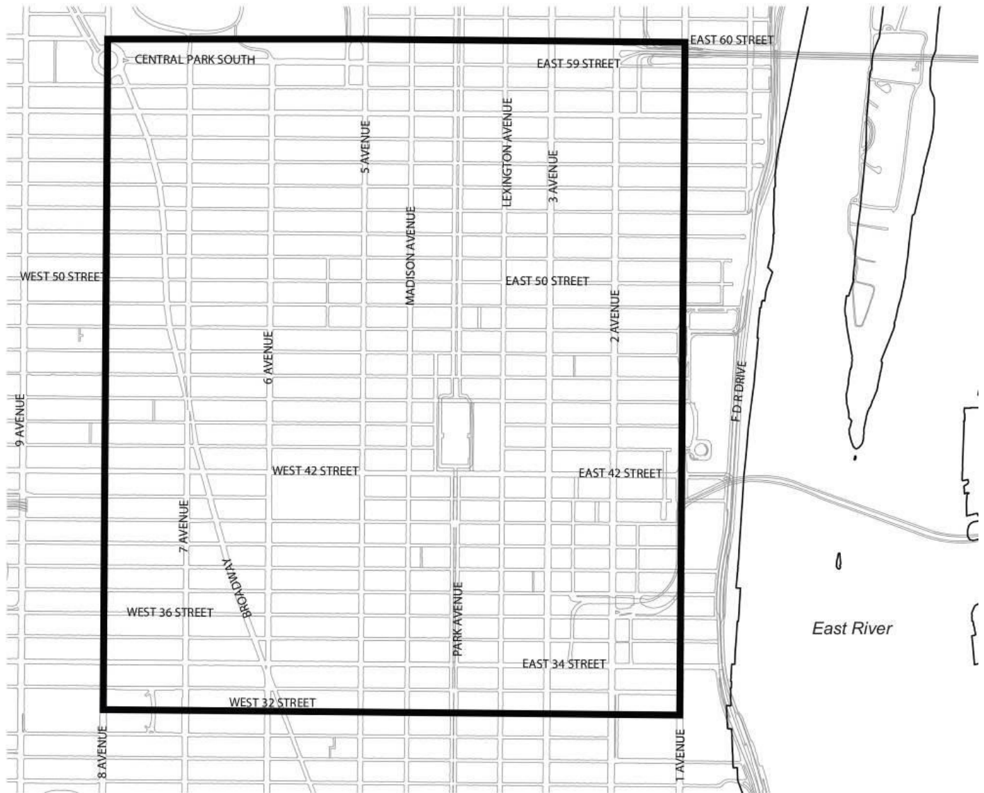
Map 2 — Area where public parking lots are not permitted in the downtown Manhattan Core