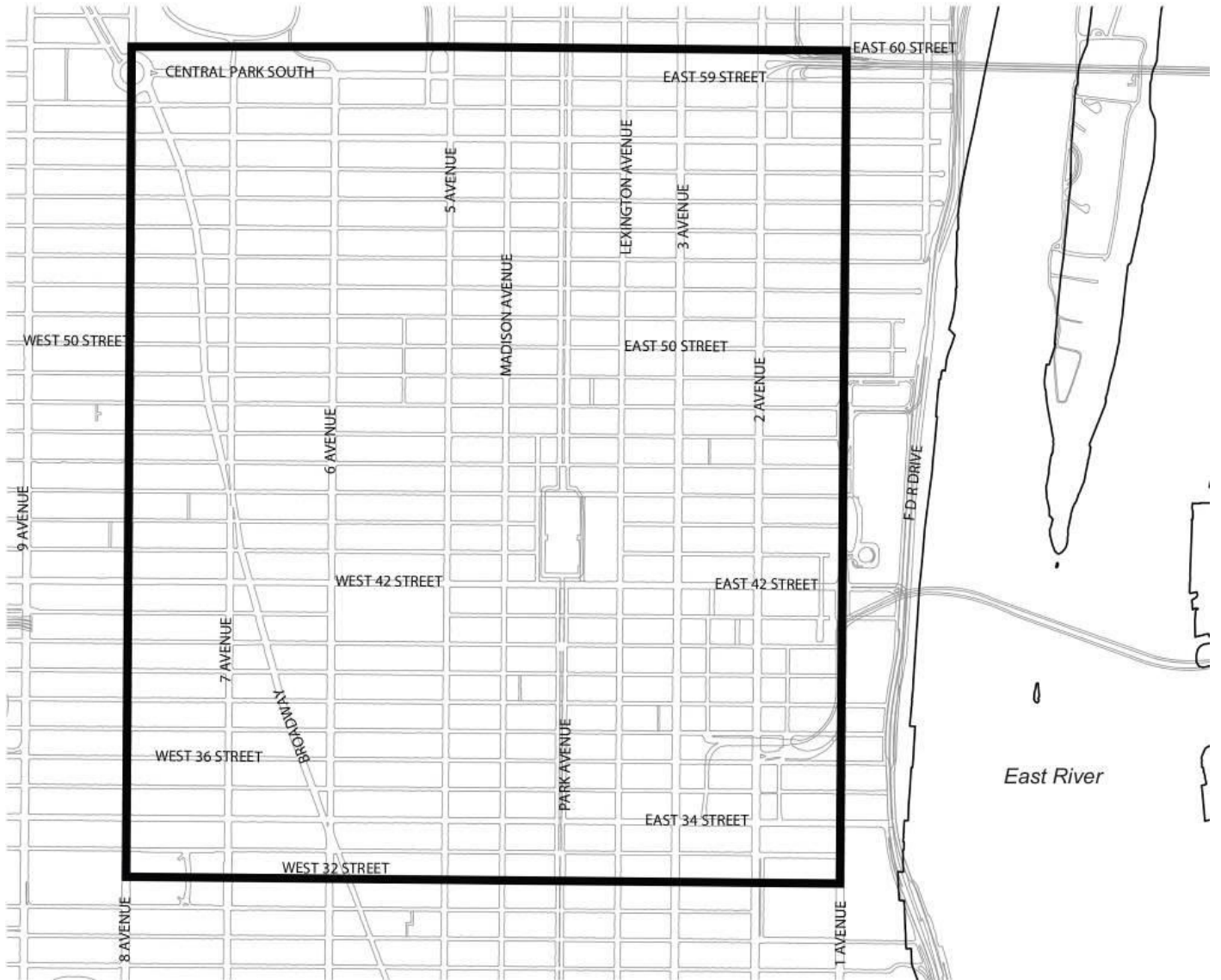
Map 2 — Area where public parking lots are not permitted in the downtown Manhattan Core