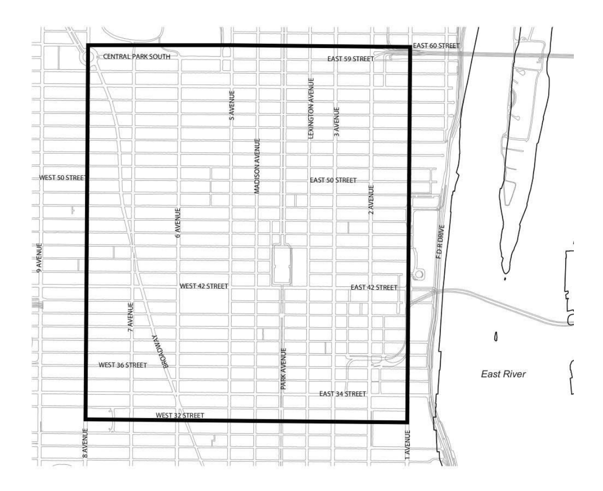
Map 2 — Area where public parking lots are not permitted in the downtown Manhattan Core