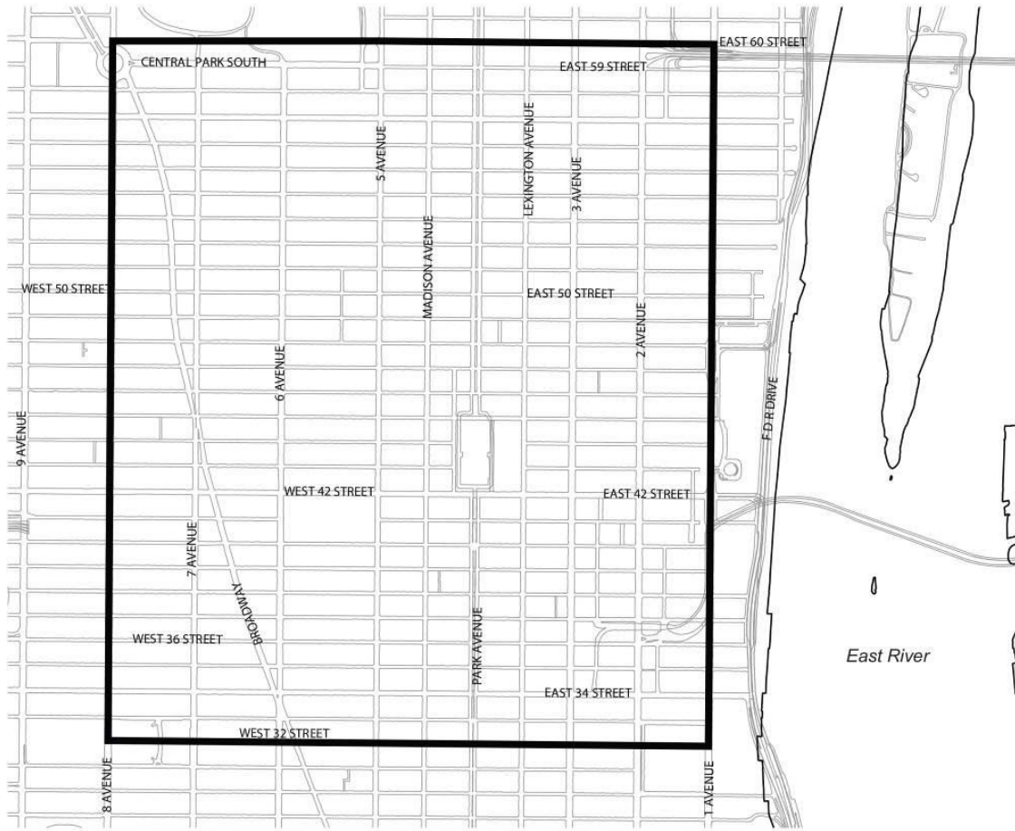
Map 2 — Area where public parking lots are not permitted in the downtown Manhattan Core